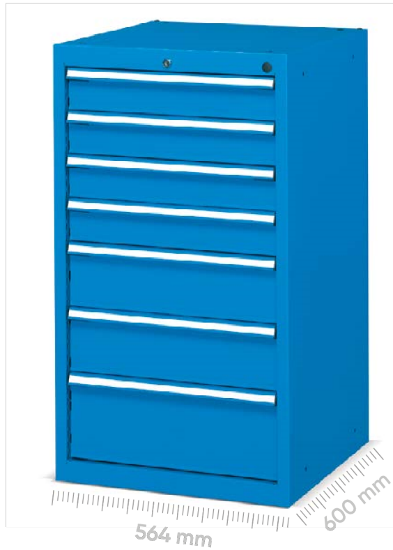
● ART. F DB 1090 52 04 H = 1000 mm - 7 drawers