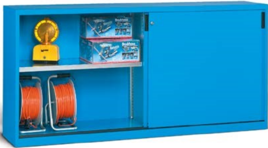
H 1000 mm