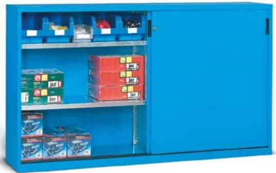
H 1200 mm

2 adjustable shelves ART. F AC 2450 01 99 - load capacity 100 kg 1 centre support