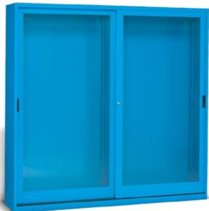
H 2000 mm

Empty cabinet with doors and centre support Internal dimensions per compartment mm 995x370x1850 H