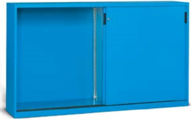
H 1200 mm

Empty cabinet with doors and centre support Internal dimensions per compartment mm 995x370x850 H