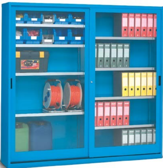
H 2000 mm

CABINET WITHOUT CONTAINERS ART. F AB 7200 03 04