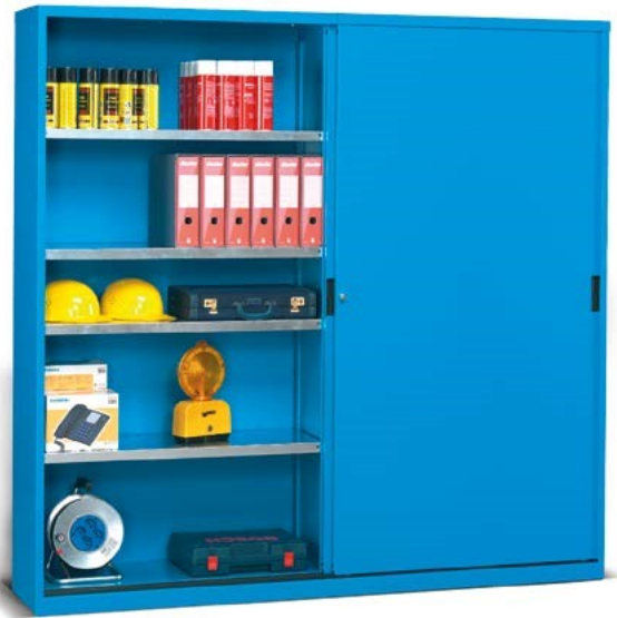
H 2000 mm

CABINET WITHOUT CONTAINERS ART. F AB 7302 01 04