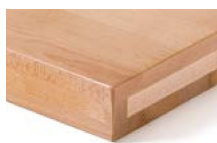
3 BEECH WOOD CROSS LAYERS