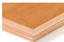
MULTIPLEX BEECH WOOD